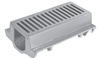
2950, 1 Ft, Outlet